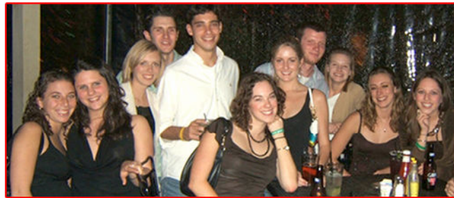
These girls in New York had a "Get Over It Day" Bonfire in 2006

Start with the "Get Over It Day" Package and then get creative! What will your "Get Over It Day" Tradition be?